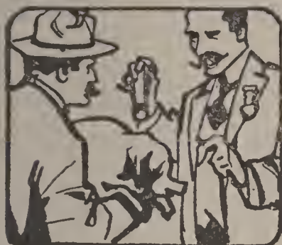
The Little Pig Won a Prize.

T HE children hadn't been told an animal story for some time, and daddy thought it was high time to tell one.